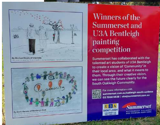
The posters on display at 52 Golf Road (corner of Beryl Ave.) Oakleigh South plus some great advertising for U3A Bentleigh

!6/11/22 at 1pm-2pm in room 41 Book in on line or sign in on the day.